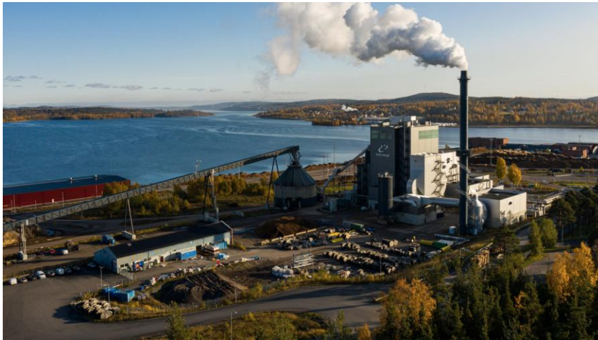
Övik Energi's production facility that will supply CO 2 for eFuel