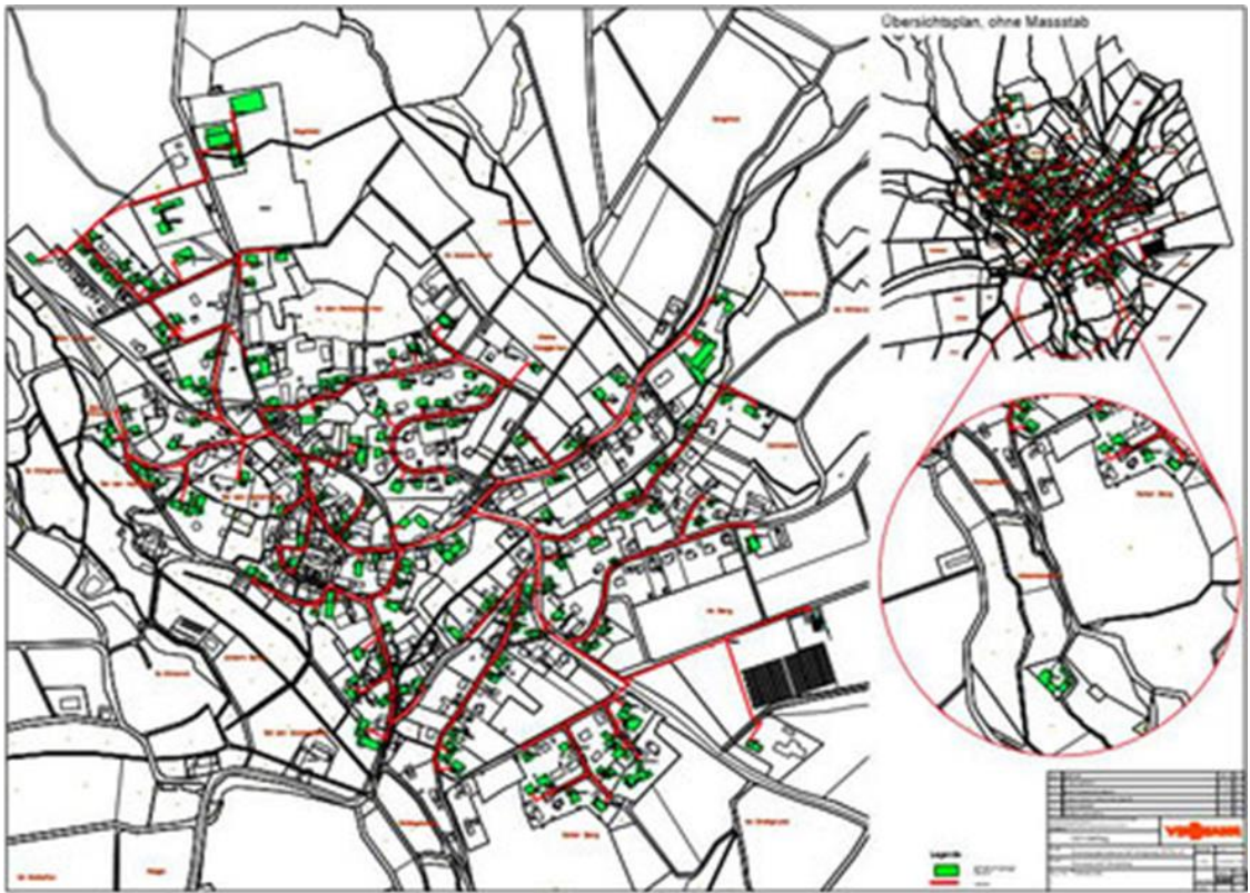
Routes of the pipelines in Mengsberg.