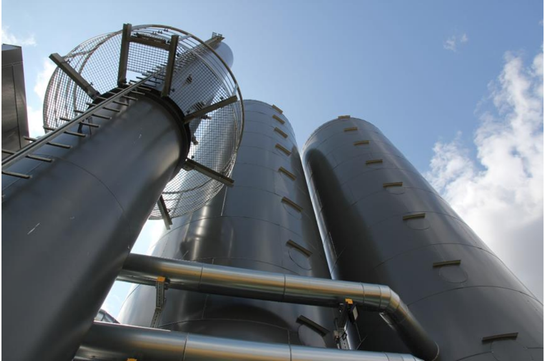
Buffer storage for solar energy.