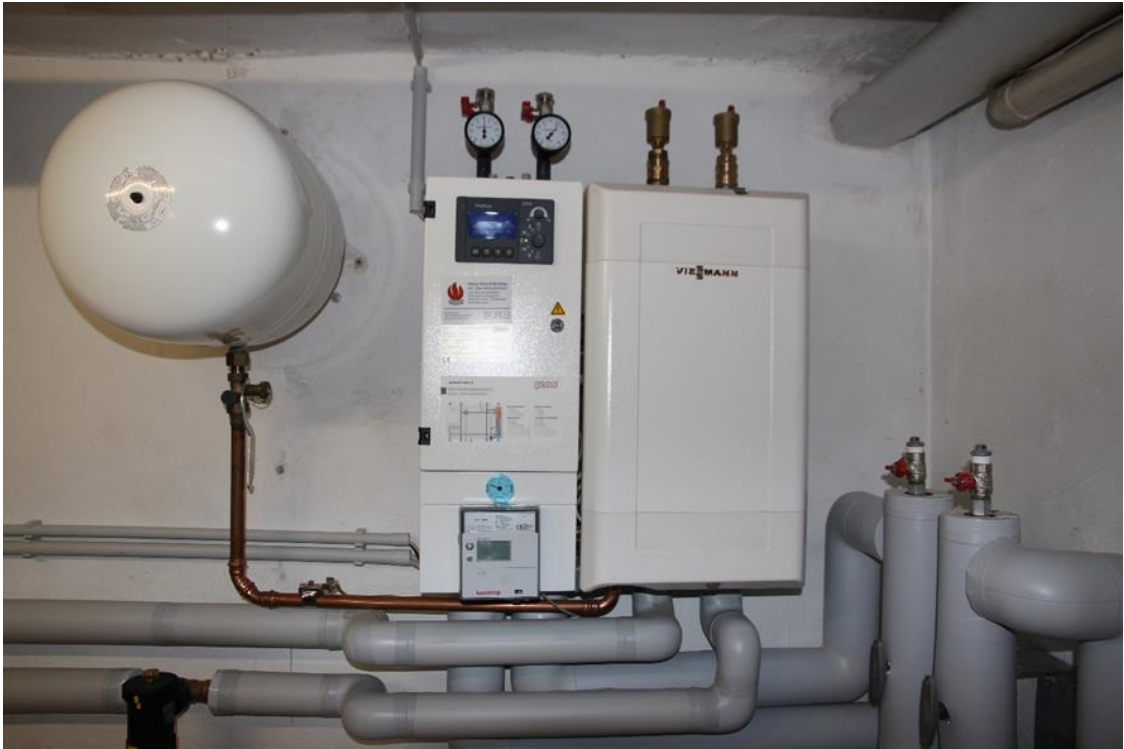
House transfer station.