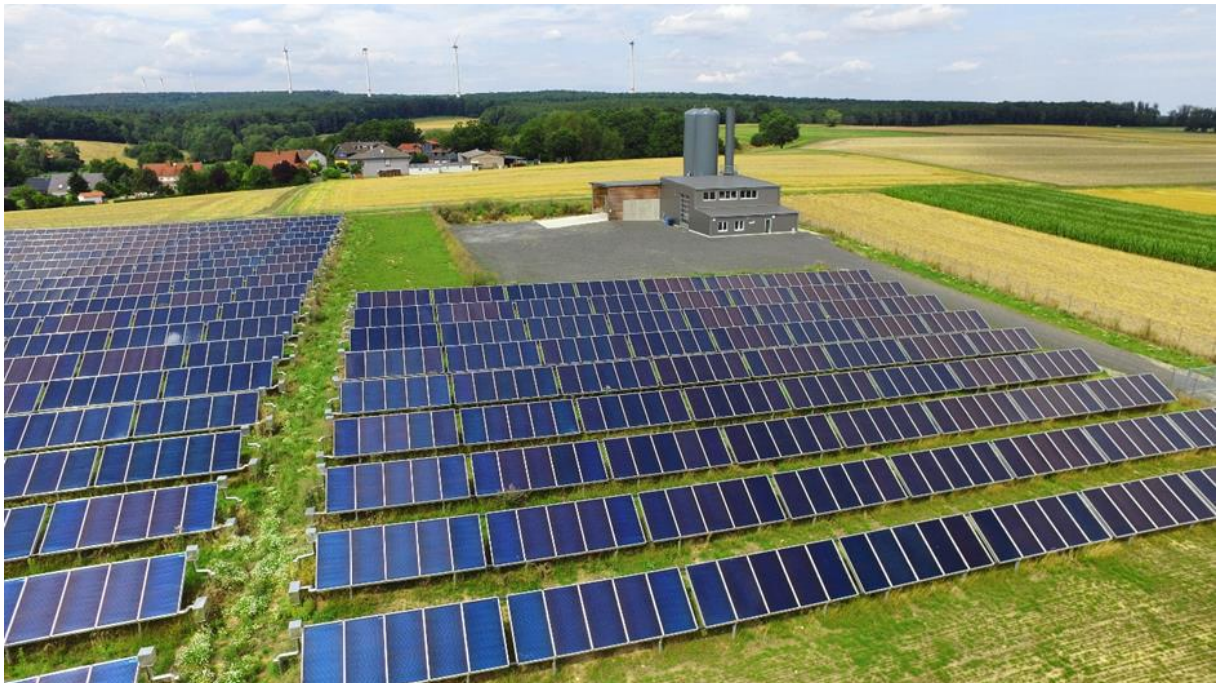
Mengsberg Energy Station. Source: Bioenergiegenossenschaft Mengsberg eG

https://www.dbfz.de/projektseiten/smarte-bioenergie/beispieluebersicht/mengsberg/