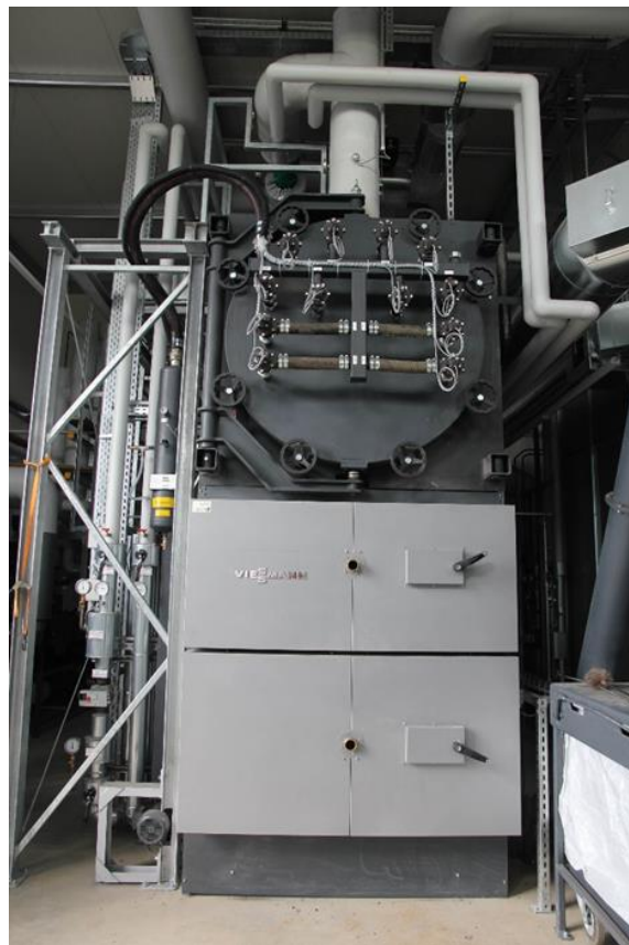
The boiler for firing wood chips.