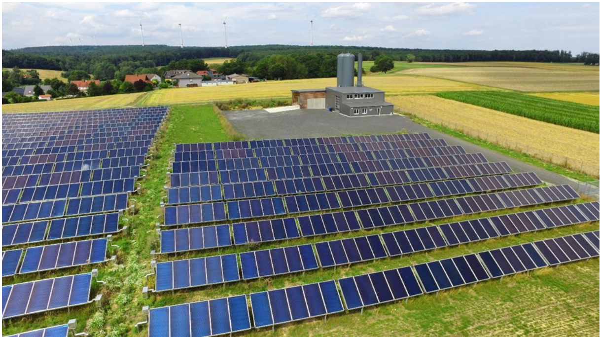
Mengsberg Energy Station. Source: Bioenergiegenossenschaft Mengsberg eG

https://www.dbfz.de/projektseiten/smarte-bioenergie/beispieluebersicht/mengsberg/